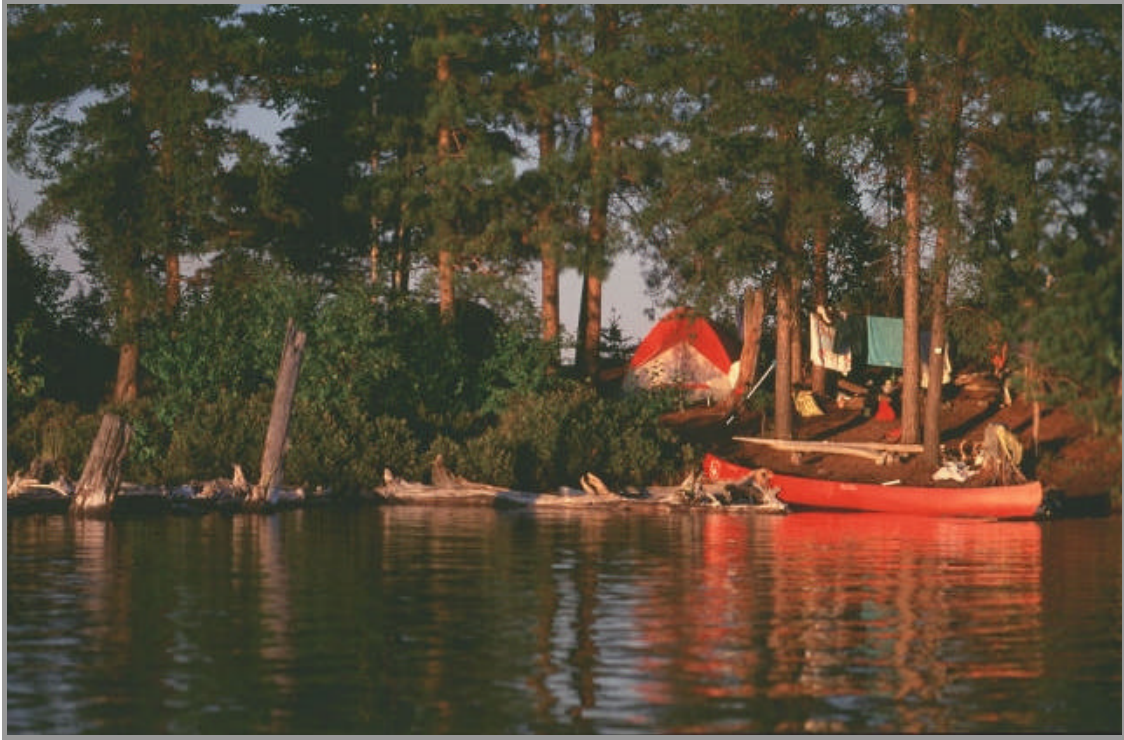
St. Raphael Provincial Park - Management Issues and Options